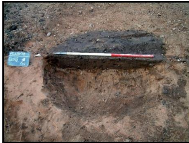
The slight remains of a Neolithic pit which contained worked flint c. 5,000 years old

Actual settlement sites are far less well understood, but concentrations of artefacts, including flint and stone tools and pottery sherds, are generally assumed to indicate areas where Neolithic groups settled.