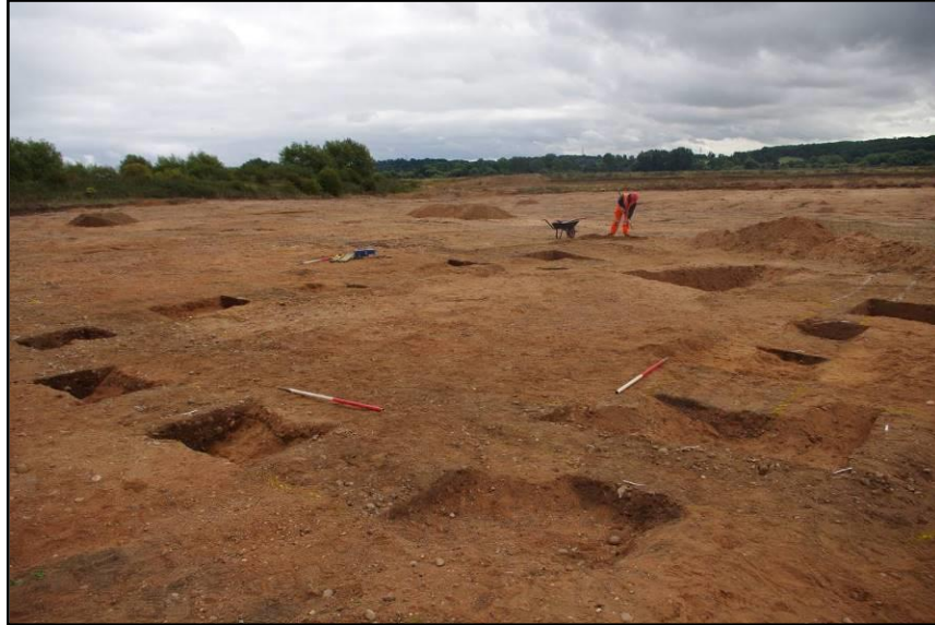
Excavation of a rectangular Saxon enclosure

household goods were made largely of textile, wood, and leather, which do not usually survive in the archaeological record.