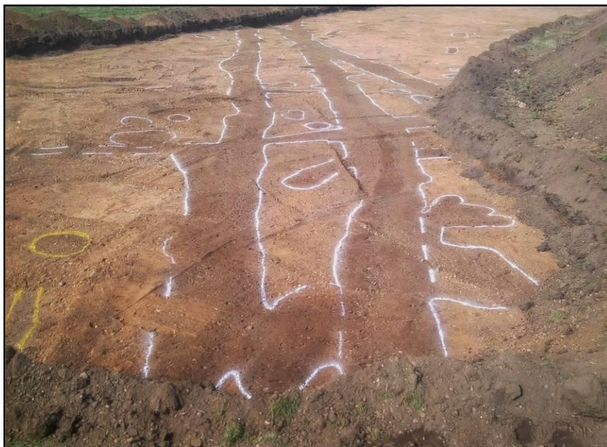
Following the initial soil strip archaeology is sprayed up prior to planning and excavation

Hanson's twelve-year relationship with Phoenix Consulting Archaeology Ltd has resulted in a number of excavations taking place across the quarry, with significant archaeological items being recovered dating from the Neolithic period (c. 3,500-2,000 BC) through to Medieval times (1066-1500). The potential for archaeological interest was originally highlighted following an evaluation of the site (geophysics and trial trenching), undertaken as part of the planning application process for the quarry.