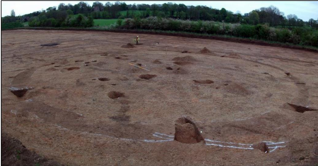
Excavation of the Bronze Age ring ditch in progress

Excavations at the southern end of the quarry has identified a concentrated area of Roman (AD 43-410) activity, represented by a series of overlapping agricultural enclosures and stock pens. These areas corresponded to formerly recorded cropmark plots which survive well on the elevated gravel terrace. A large pottery assemblage has been recovered, together with several quern stones for the grinding of corn. The lack of settlement features, such as house structures and rubbish pits, suggests that occupation did not take place on the site, but that it was not far away. The bulk of the Roman pottery comprises local coarse wares, predominantly cooking pots, with close affinities to wares produced in Derbyshire. Low quantities of regional imports, notably Dorset black-burnished ware and Mancetter-Hartshill white ware mortaria (grinding vessels) are consistent with supply patterns in the hinterland region between Wall and Rocester.