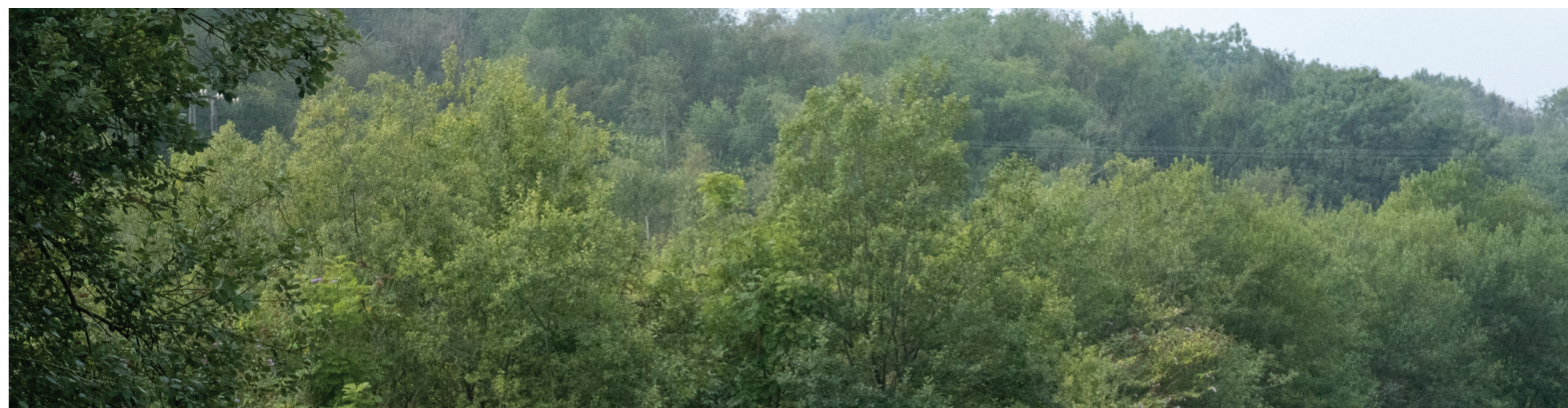
▲ The restoration of Westdown quarry and Asham quarry void would provide a tenfold increase in woodland habitat