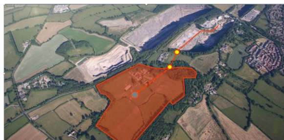
Proposed temporary haul road