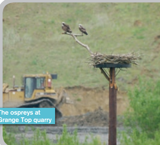
The ospreys at Grange Top quarry