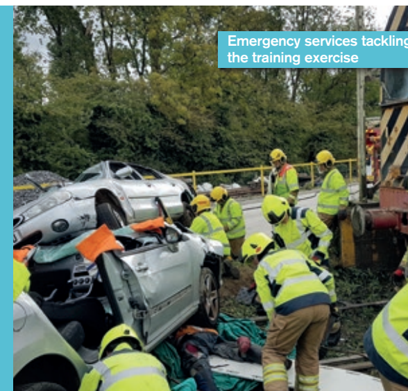
Emergency services tackling the training exercise

Within an hour of the first call, all casualties had been rescued.