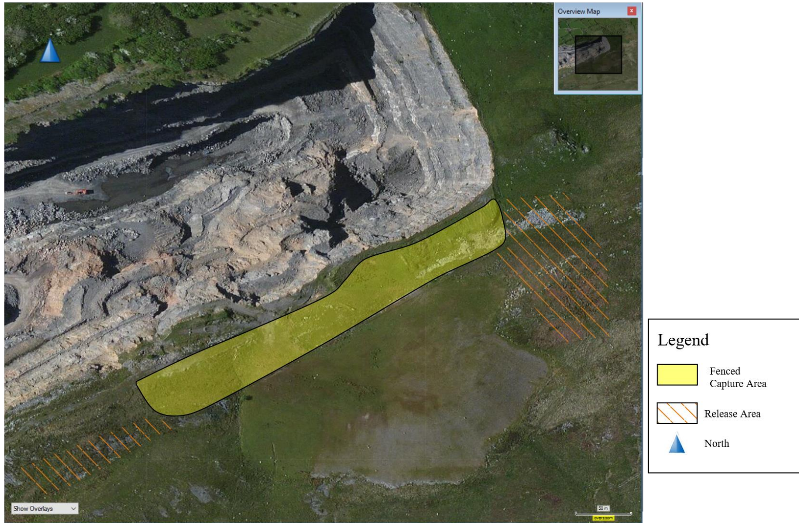
Appendix 1: Map showing translation zones and reptile capture locations.